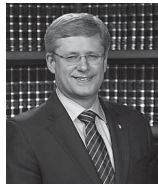
The Rt. Hon. Stephen Harper, P.C., M.P.

Please accept my best wishes for an enjoyable and productive session of deliberations.