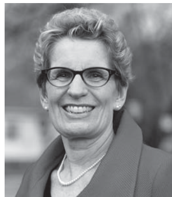
Kathleen Wynne Premier

A handwritten signature in cursive script that reads 'Kathleen Wynne'.